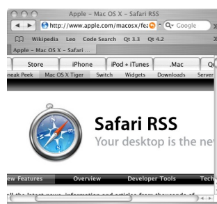
Cross-browser and cross-platform testing with Squish/Web.